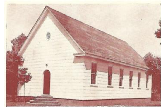
This is the first building erected on the property.

Avondale began with a chapel that was made from reassembled old lumber from an abandoned schoolhouse near Waxhaw. It was during World War II, so building materials were not available. The chapel had an assembly room and four classrooms. It was heated by a pot-bellied stove.