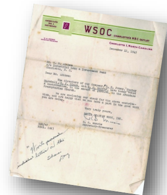
Letter from 1945

*Dates and events are subject to change.