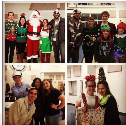
Avondale Youth Christmas Par-