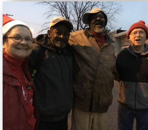
Uptown Meal Ministry Christmas Party