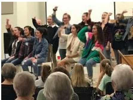
Lip Sync Contest, Joke-Off, chocolate syrup, raw eggs... Family Fun Night was a blast!

Youth fellowship gatherings resume in September, starting with the Youth Kick-Off. The 2017-18 Youth Fellowship schedule should be approved and ready after the Kick-Off.